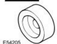
Remover rear differential rear bush 502-009/2