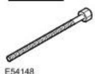
Remover/Installer long 14mm bolt 502-009/5