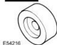
Installer rear axle front bush 205-825/3