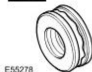
Bearing set for 14mm bolt 51204