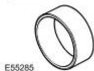
Bearing Housing 502-009/6